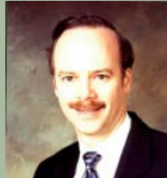
NEAL LEWIS SUSTAINABILITY INSTITUTE